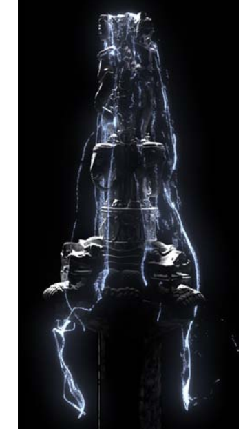
Figure 2: Fluid animation using our out-of-core framework.

for maximal flexibility for a particular application.